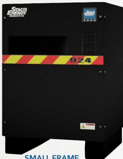
SMALL FRAME 0.75 - 3 KW