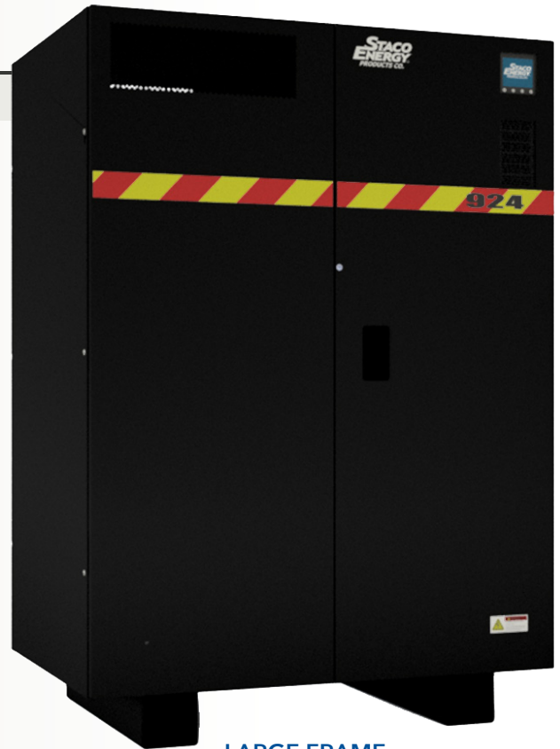
LARGE FRAME 4.2 - 18 KW